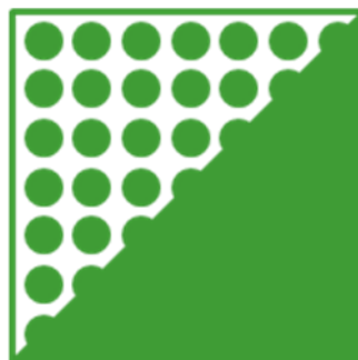
ORAFLEX® 11552 medium