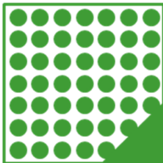
ORAFLEX® 11522 soft