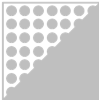
ORAFLEX® 11552 medium